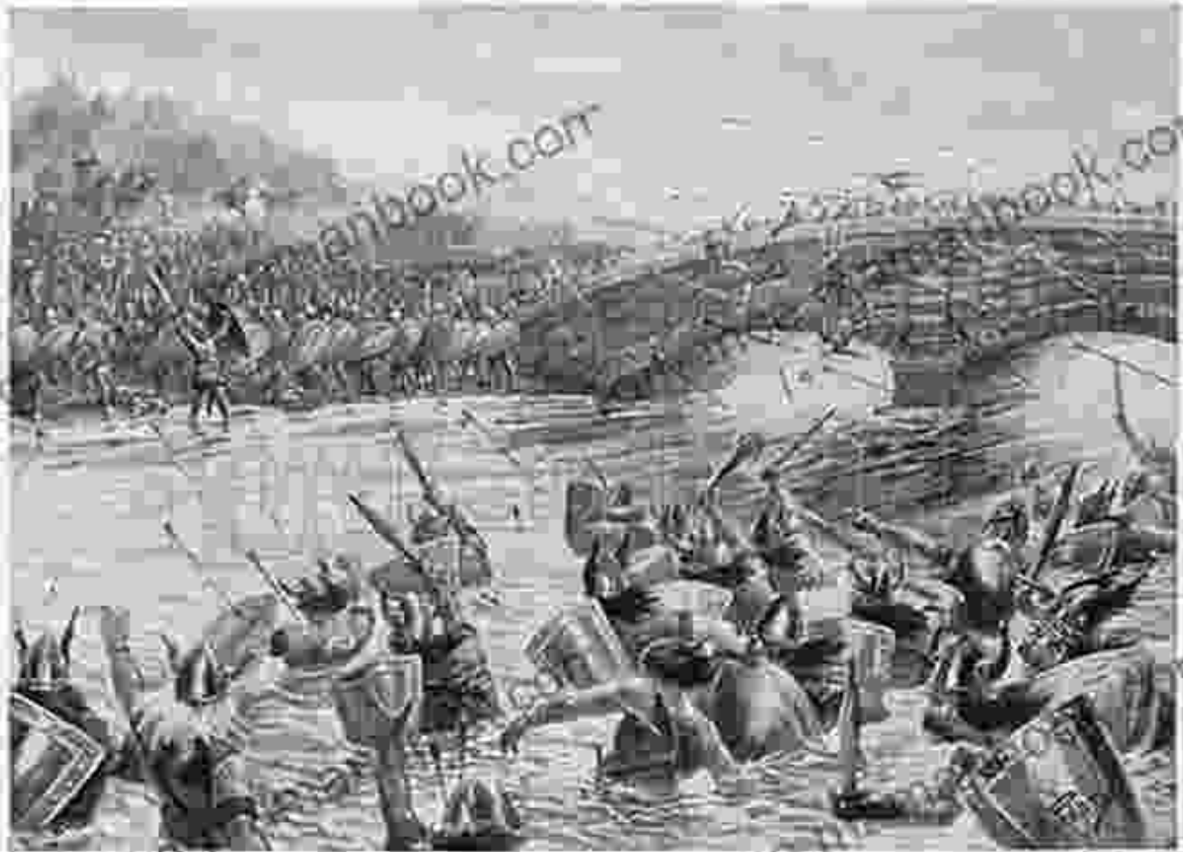
THE BATTLE OF MALLOW